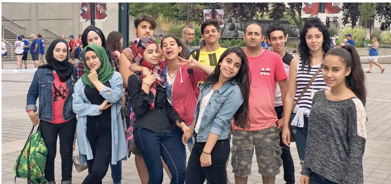
Refugee Youth Leadership Program participants having fun at a Blue Jays Game.

The goal of the program is to engage and inspire confidence in youth and to ensure that more refugee students stay in school and provide successful models for future arriving refugees.