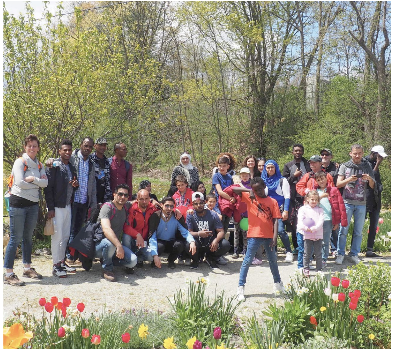
Mother's Day Hike at the Limehouse Conservation Area with the Toronto Bruce Trail Club.

COSTI is proud to have been a part of key organizations including the Toronto Region Immigrant Employment Council (TRIEC), the Consortium of Agencies Serving Internationally-trained Persons (CASIP), Local Immigration Partnerships in Toronto and the Regions of Peel and York, the National Settlement Council, Canadian Council for Refugees, Peel Newcomer Strategy Group, Peel Syrian Refugee Settlement Support Group, Ryerson University Employment Round Table, and the Resettlement Adaptation Program Working Group.